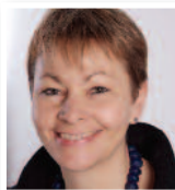
Dr Caroline Lucas MP, Safer Medicines Patron

“The case for animal testing is now being directly challenged by scientists and doctors and their judgement must be taken seriously.”