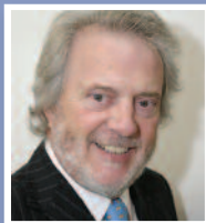
Co-sponsor David Amess MP (Conservative)

"It is astonishing that animal testing has never been scientifically evaluated. This process is long overdue."