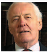
Tony Benn, Safer Medicines Patron

A million Britons are hospitalised by prescription medicines every year, costing the NHS £2 billion – Compass, 2008